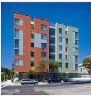
Southeast facade with rainscreen cladding and high- performance windows