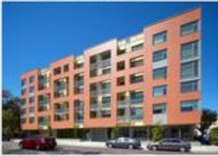
TOP: New high-density development at edge of eclectic mixed-use neighborhood; BOTTOM: Southwest facade with screen wall facing adjacent freeway