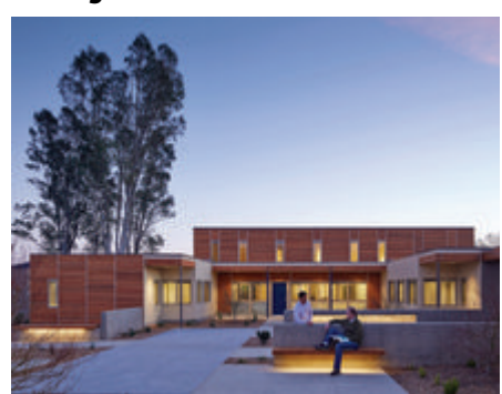
Entry Courtyard At Residence

Sweetwater Spectrum is a new national model for supportive housing for adults with autism, offering life with purpose and dignity. Created to address a growing housing crisis for adults with autism, this new community for sixteen residents integrates autism spectrum design, universal design, and sustainable design strategies.