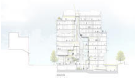
East-West Section showing daylighting in the building.

The radiant slab system maintains the massive concrete structure at a stable temperature, while a low-volume dedicated outdoor air system with enthalpy wheel heat recovery provides ventilation when outdoor conditions are not favorable for natural ventilation.