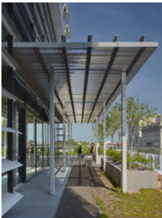
Roof terraces provide users with access to fresh air and collect rainwater runoff for remediation and reuse.