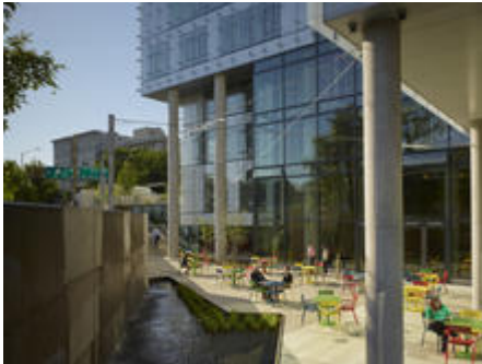
Sunken Garden located below grade at level 00 providing the site with visual and acoustical buffer to the freeway.