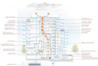
East-West Section showing rainwater runoff reuse and natural ventilation within the building. - Photo Credit: Behnisch Architekten

Extensive site and climate analyses were performed at the outset of design, to inform the