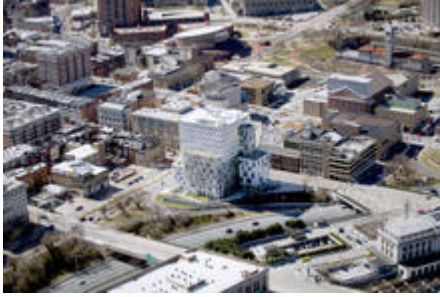
Aerial view from the Northeast showing the building's urban context.