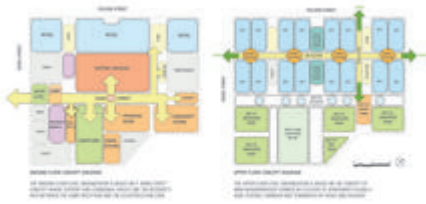
Measure 1 - Second Image - Photo Credit: LMS Architects