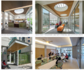
Measure 1 - Third Image

The key issue for Rene Cazenave Apartments was seeking ways to combine environmental, financial and social sustainability. As such, the design team focused on strategies that simultaneously addressed these goals. These strategies included reducing long term energy use and costs, creating healthy living environments, and maximizing seismic resilience.