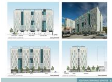
Additional Images - Second Image - Photo Credit: LMS Architects / Tim Griffith