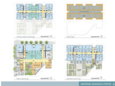
Additional Images - First Image - Photo Credit: LMS Architects