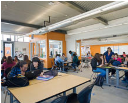
This photo shows students working in small groups in a typical paired classroom with the movable wall open. The teacher offices penetrate into the space to facilitate constant access between the students and faculty.