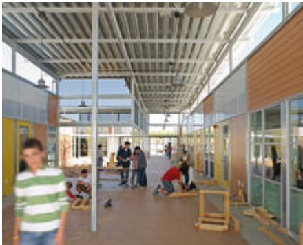
Exterior spaces adjacent to classrooms are used as workshop spaces in the project-based learning environment shown in the photo.