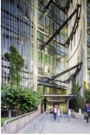
The building's west-facing reeds filter the sun's rays and host a variety of native deciduous vines.

The most prominent feature of EGWW are the staggered vertical “reeds” on the west façade, which not only shade the building, but support a native ecosystem. A tapestry of climbing vines ascend the reeds, connecting the building to the ground plane and surrounding landscape – a lush arrangement of plants selected from the bio-region for their qualities of beauty, drought tolerance, soil adaptability, and compatibility with security guidelines. The deciduous vines also allow extra light into the building during winter; in autumn they provide a pop of color.