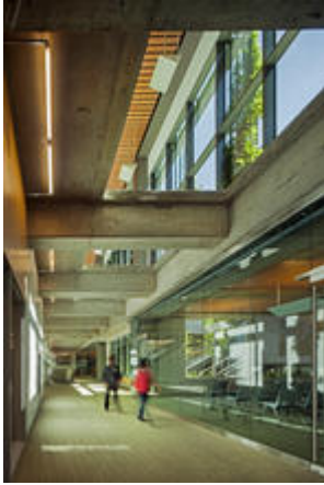
Daylight penetrates to underground conference level.

Based on the design, analysis, and construction process alone, EGWW appears to be a remarkably successful renovation. But success lies in how well the building actually performs. Recognition of this fact has led to a set of aftercare studies and services to fine-tune the building's performance – both for energy efficiency and occupant satisfaction.