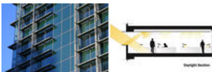
Because of the importance daylighting plays in human health and comfort, the project optimized daylighting in the perimeter zone utilizing a task/ambient approach to lighting.