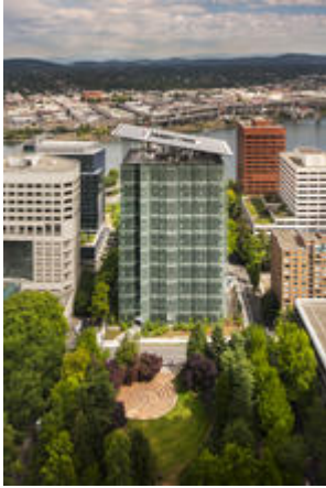
View from neighboring building, looking east