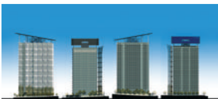
Building elevations - Photo