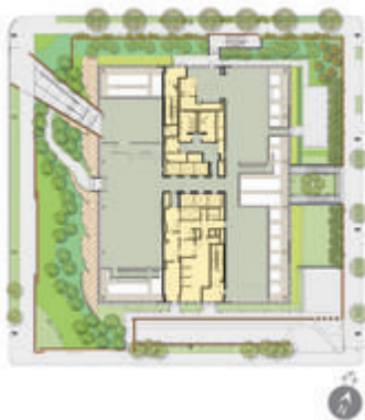
Entry plan