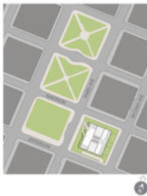
Site plan