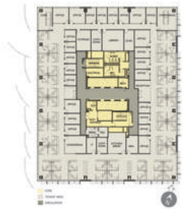
Typical tenant floorplan - Photo Credit: SERA