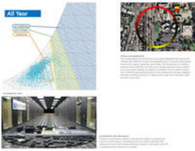
Psychrometric, wind and solar analysis informed the design