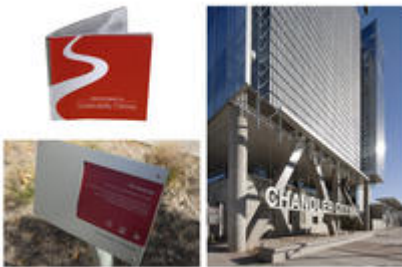
Images of “Sustainability Pathway” and “Turbulent Shade” façade system - Photo Credit: Bill Timmerman

A very accessible dialog of sustainability has been interwoven into the project through two key elements. A poet and graphic artist created the “Sustainable Pathway,” which provides visitors a self-guided tour of the building's sustainable elements marked by descriptive signs and noting whether the strategy is socially, economically or environmentally focused. A public artist created “Turbulent Shade,” an shading element that is very much connected to the physical environment by moving with the wind. Sustainability is on display for the community to interact with.