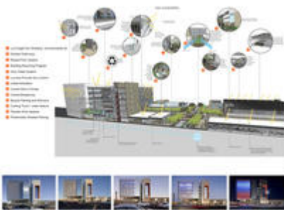
Overall sustainability diagram and images of “Turbulent Shade” Public Art

From an environmental and ecological standpoint, the design responds to the harsh desert climate and at the same time provides for appropriate outdoor spaces that introduced much-needed green space back to the heart of the downtown. Pushing the project footprint out to the site edges allowed for the design of a central courtyard that took advantage of shaded walkways and landscaping, channeling prevailing winds and evaporative cooling from a central water feature to temper the environment.