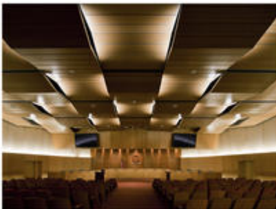
Council Chambers - Photo Credit: SmithGroupJJR