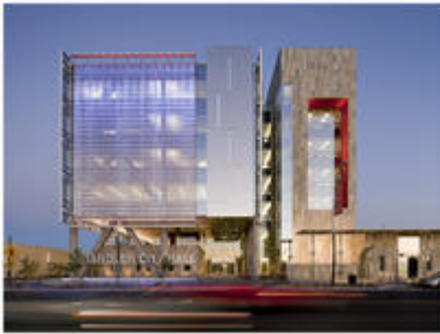
View of office tower from west